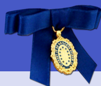
2018 Awarded the Gold Medal for Professional Merit