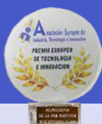
2021 Awarded the European Price For Technology & Innovation