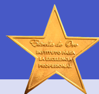
2017 Awarded the Gold Star for Professional Excellence