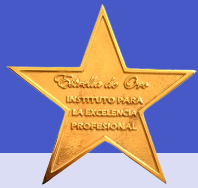
2017 Awarded the Gold Star for Professional Excellence