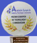
2021 Awarded the European Prize For Technology & Innovation