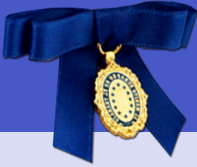
2018 Awarded the Gold Medal for Professional Merit