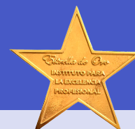
2017 Awarded the Gold Star for Professional Excellence