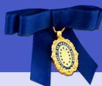
2018 Awarded the Gold Medal for Professional Merit