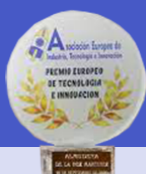
2021 Awarded the European Prize For Technology & Innovation