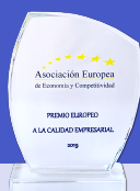
2019 Awarded the European Prize for Business Excellence