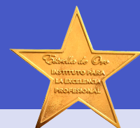
2017 Awarded the Gold Star for Professional Excellence