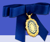
2018 Awarded the Gold Medal for Professional Merit