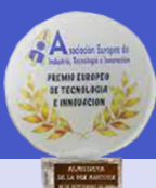
2021 Awarded the European Prize For Technology & Innovation