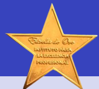
2017 Awarded the Gold Star for Professional Excellence