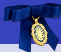
2018 Awarded the Gold Medal for Professional Merit