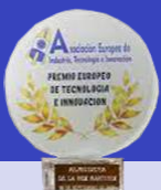
2021 Awarded the European Prize for Technology &